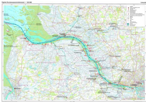
The Elbe today