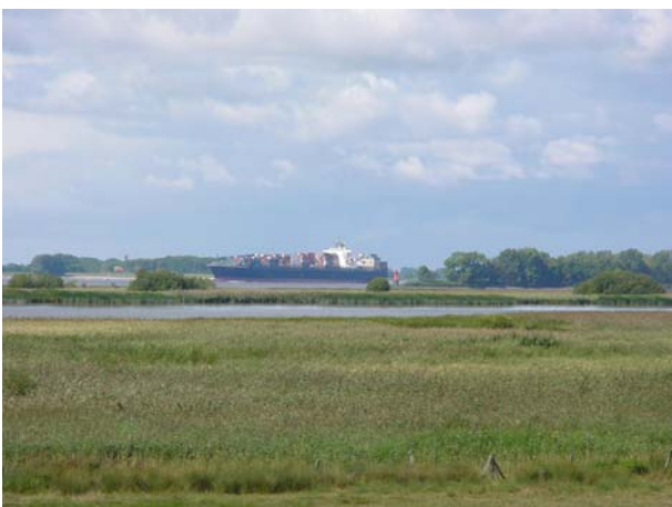
Maintenance of branches

The Federal Administration for Shipping and Waterways and the Hamburg Port Authority developed a concept for the development of the Elbe estuary. It consists of a variety of measures to stabilize the tidal regime and morphology, the sediment dynamics, the efforts of channel and harbour basin maintenance and to meet goals of environmental quality. To increase tidal dissipation, compensate tide-induced sediment fluxes and create new tidal marshes are the most important elements of the concept.