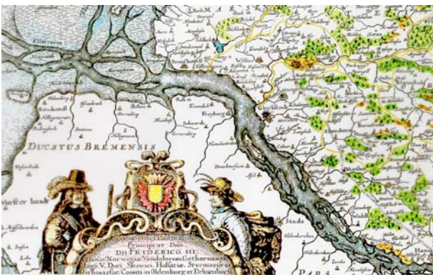
The Elbe estuary at 1650